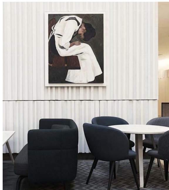
Swansong by Karin Mamma Andersson